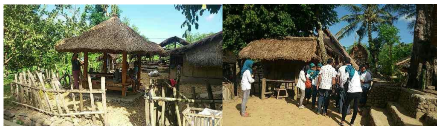
Fig. 2. Sasak Homestay "Bale Tani"

One of East Lombok societies' traditions which are still maintained is weave tradition. Weave activity is a must for every woman, especially in Sukarara Village. Weave activity is done by 10 years-old women to adult women. This duty is due to a limited job in East Lombok region. Since farming is not their daily activities, so weave is done in their free times. Weave activity for 10 years-old women usually began by weaving small cloth with easy designs. Weavers in Sukarara Village are about 3000 people, with the highest level of them is 16 years-old weavers. They are the productive generations in producing woven clothes in Sukarara Village, East Lombok, West Nusa Tenggara, Indonesia.