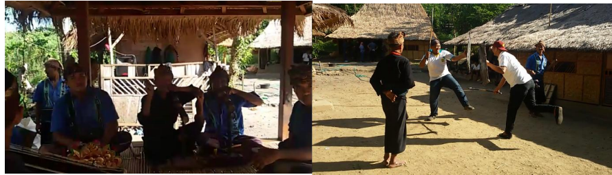
Fig. 1. The Performance of Traditional Dance by the Lombok Society (Sasak tribe) accompanied by traditional musical instruments are cilokaq and gendang beleq

East Lombok societies (Sukarara Village) still strongly occupy their ancestor's customs and traditions. East Lombok becomes a cultural supplier region for some areas, as described on 8 Culture groups which consist of Gendang Beleq Group, and Cilokaq and Kasidah Group; and 15 Tradition groups consist of Banjar Kematian Group, Yasinan , Hiziban , and Arisan . Besides to ensure continuing cultural tools and the groups, strong tradition in a family relationship is also close. It is reflected in special characteristics of family events or every special celebration. It shows below.